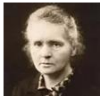
Marie Curie Physicist, Chemist, Scientist

6 th Feb. 2019 , Vigyan Bhavan, New Delhi