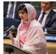
Malala Yousafzai Female education activist, Nobel Prize laureate

“Empowering women is a prerequisite for creating a good nation, when women are empowered, society with stability is assured. Empowerment of women is essential as their value system leads to the development of a good family, society and ultimately a good nation.”