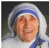
Mother Teresa Nun, Teacher