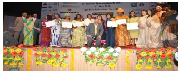
Hon'ble Lady Ambassadors in CMAI Event