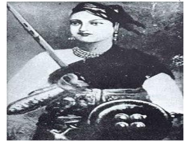
Lakshmibai Rani of Jhansi