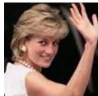
Diana, Princess of Wales Crown Princess